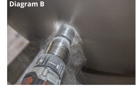
Step 2. You will need a 1-1/8" Hole Saw for masonry applications to create the hold for the valve. Drill the hole perpendicular to the face of the bowl.

Going too high may cause the valve to protrude from the top and interfere with the fire pan.