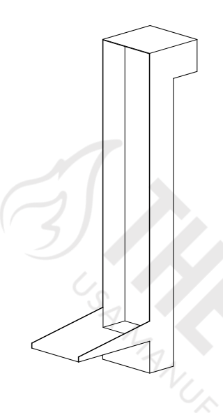
Scupper Inlet C 4"